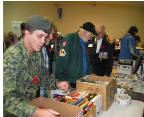
Customers browse FCWM books for sale at Billings Bridge, Nov. 5, 2009.

ter of Friends volunteers staff the tables through the day. The day ends with loading out all material for return and sort out at The Museum at convenient times.