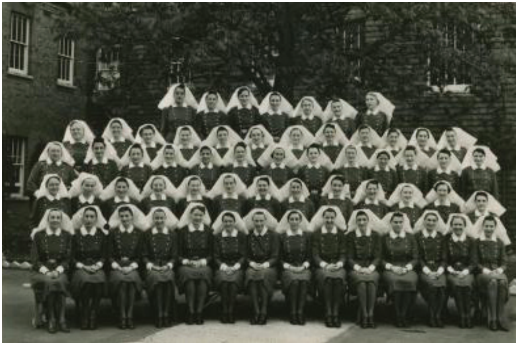
WWI Nursing Sisters

clubs, while others adapted recipes to wartime shortages and published special cookbooks as an aid to others. In addition, many of these groups held send off and welcome home parties for troops and were often at the forefront of efforts to create local war memorials.