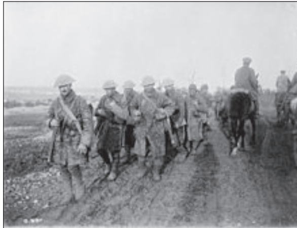
Canadians on the Somme Nov 1916

But in February the Allied scheme was upset when the German Chief of the General Staff, General Erich von Falkenhayn, seized the initiative. For his battlefield he chose the fortress-ringed city of Verdun, a position, he correctly believed, so essential to the French that France would fight to the last man to hold it. He hoped to lure French forces into the narrow, dangerous salient, slaughter them with artillery fire, and thus “bleed France to death.” By Christmas, when the battle finally ended, casualties for both sides totalled 680,000, of whom some quarter of a million were killed.