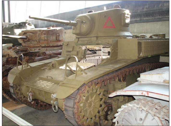
Stuart M3A1 Tank

The second new arrival is a full-fledged Afghanistan War veteran: the Armoured Patrol Vehicle known as the RG-31 Mark 3 Nyala. This is an imposing four wheeled vehicle standing over 2.6 metres (8.5 feet) tall not including the Kongsberg M151 .50 calibre heavy machine gun remote weapons station (RWS). The vehicle was