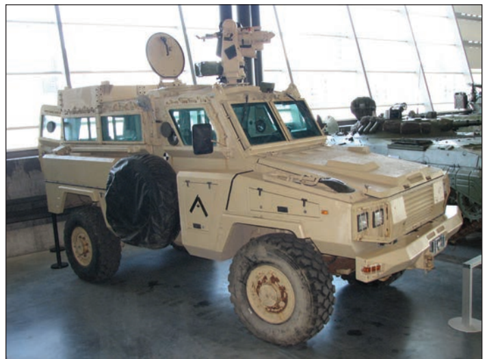
RG-31 Mk 3 Nyala

Re-emerging after a long hiatus in the shop was the popular M3 Lee. The Lee was manoeuvred into her