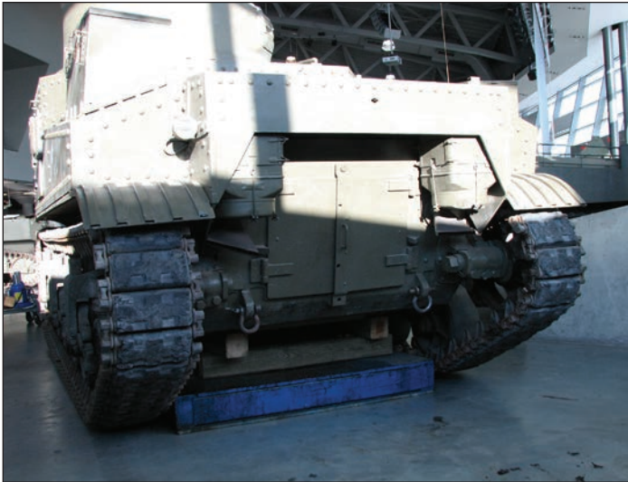
Air Castor in place under the Lee

familiar place using the Air Castor equipment, a high pressure pneumatic system designed to lift very heavy loads including our 62 ton Chieftain tank. At over 30 tons she was just a bit too large to be pushed into position using the forklift. On the other hand, the little Stuart M5A1 was easily slid into place using judicious pushes and pulls from the forklift. Somehow I sensed that Mike enjoyed this part! When all else failed human power was still effective and that is how the tracked armoured jeep was placed into her new location near the anti-tank gun collection.