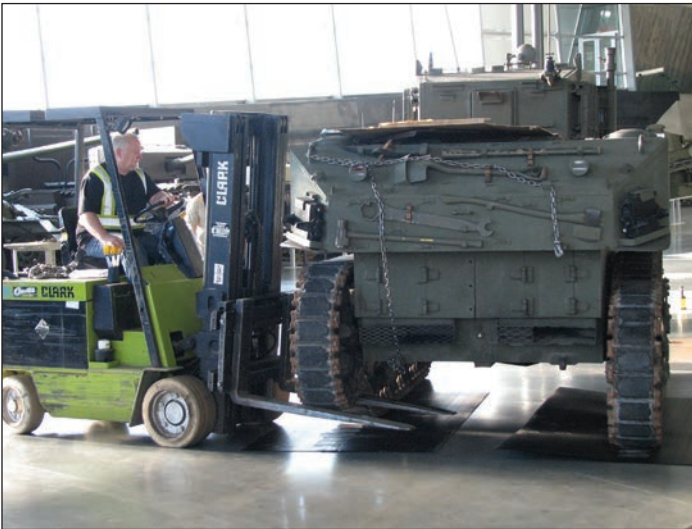
Multi-Purpose Forklift moving M5A1