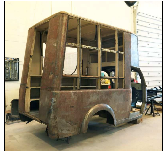
The Food Van undergoing restoration in the CWM workshop.