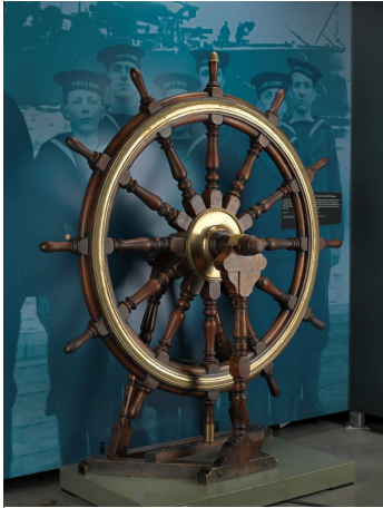
The ship's wheel of HMCS Rainbow , on display in Gallery 2. CWM 19470006-001

As noted in the May issue of The Torch , the Friends are proud to salute the Navy's centennial (May 4, 2010) by including a series of four-page supplements in the newsletter, beginning with this issue and continuing until the issue of May, 2010.