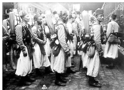
Algerian soldiers in Europe during World War I.

I think you will find this to be a fascinating collection. You can find it by scrolling through our Face Book site or by going directly to http://www.theatlantic.com/static/infocus/wwi/global/ . The following picture is an example of what you will find.