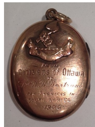
The Bartram Locket (Reverse)