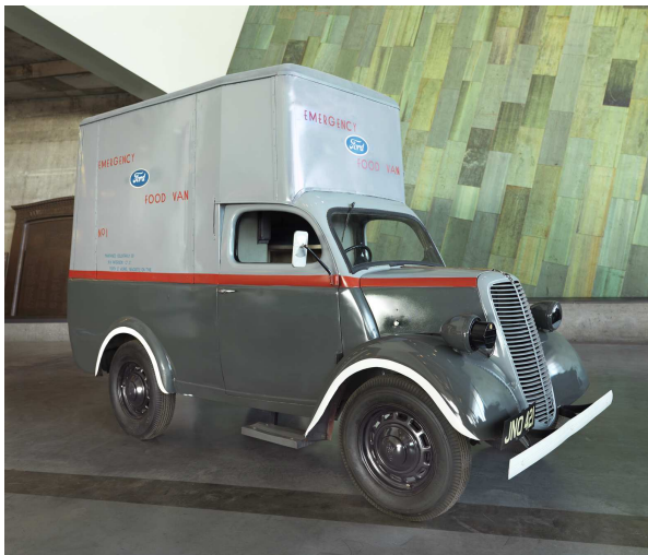
The Fordson Food Van in the LeBreton Gallery (for purposes of the photo).

The restoration of the Fordson Emergency Food Van, sponsored by the Friends, is almost complete. The vehicle will soon be on display in the LeBreton Gallery. Our example of this unusual artefact is unique among the 450 of the type produced by Ford and donated to Britain by Henry and Edsel Ford. The food vans went to the site of air raids in order to provide tea and food to emergency crews and survivors.