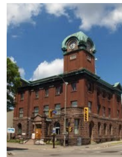
Sault Ste Marie Museum

Major changes to the LeBreton Gallery's displays are underway. The Museum is re-grouping and repositioning the equipment, organizing it into coherent themes and providing new, more complete, more visible, signage. Work should be complete around the end of March. Visitors and Friends will be pleased.