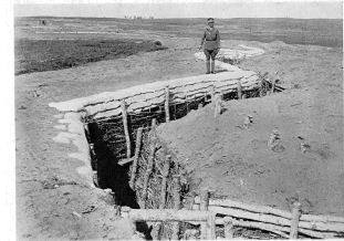
Camp Hughes Trenches –1916

All that remains of this site is a small cemetery and evidence of the trench system that was used for training – the only remaining trench system in North America.