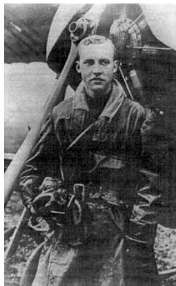
Wilfrid "Wop" May

He was instrumental in the formation of the first Flying Club in Canada, the Edmonton Aero Club, in 1927; established Canada's first commercial airport, Blatchford Field; flew the first airmail to the Canadian Arctic in 1929; worked with the RCMP in tracking the "Mad Trapper" in 1932; formed the Para-Rescue Service for the RCAF; and was