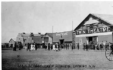
Camp Hughes – 1916

Camp Hughes was a huge training area for the Canadian army and at its peak in 1916 was the second largest (by population)