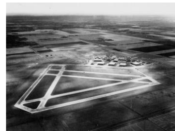
Base that was #33 Service Flying Training School (SFTS).

On the south-east side of Carberry, where a large potato processing plant is now located, one can still see vestiges of the World War II, British Commonwealth Air Training Plan (BCATP)